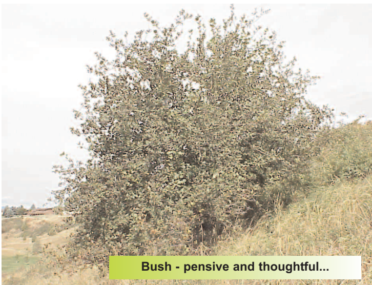
Bush - pensive and thoughtful...

"That woman who knew I had dyslexia: I never interviewed her."