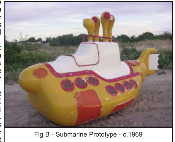
Fig B - Submarine Prototype - c.1969

"Look, it's not 1966,"she said. "In my life, things don't